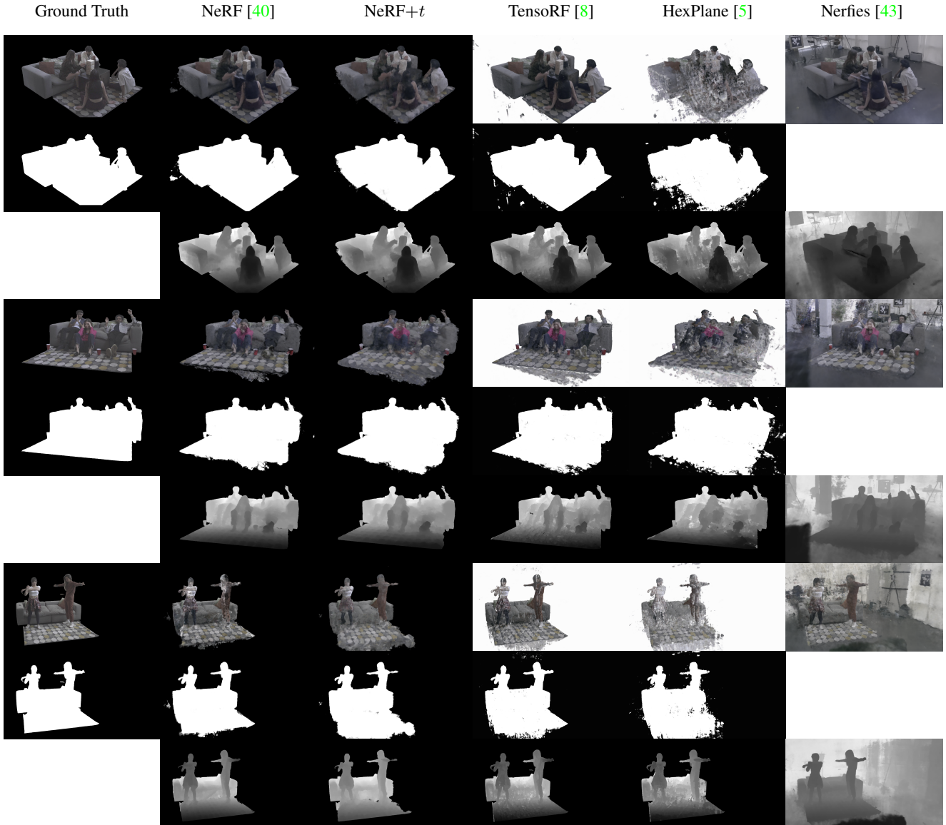
Figure 2. Qualitative results on the flyaround (semi-static) phase of 3 different scenes. Each section contains 3 rows: rendered RGB image, rendered opacity mask, and rendered depth map. Note that NeRFies is not trained to produce opacity masks, so we skip these renders.

TensorRF and HexPlane. TensorRF [8] shares with NeRF the underlying idea of volumetric rendering through emission-absorption ray marching. However, instead of modelling the radiance field with an MLP, TensorRF proposes to model it through a product of a set of 2D ( M^{XY} , M^{YZ} , M^{XZ} ) and 1D tensor components ( v^X , v^Y , v^Z ), which factorize the 3D density and color spatial fields in a memory- and computationally-efficient manner.